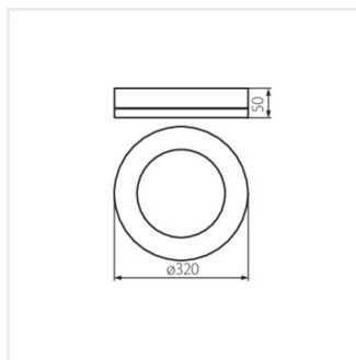
TURA LED 24W-NW-O-B