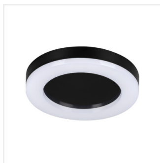
TURA LED 24W-NW-O-B