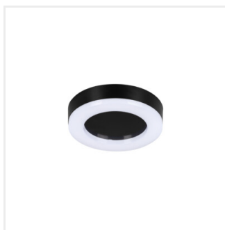
TURA LED 15W-NW-O-B